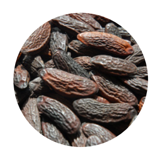
Tonka beans Dipteryx odorata

Our products: pink peppercorns CO2 extract