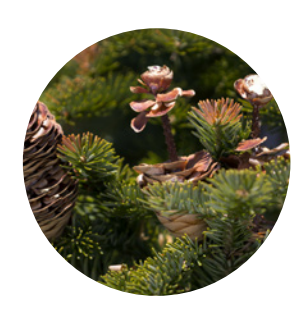
Siberian pine Abies sibirica