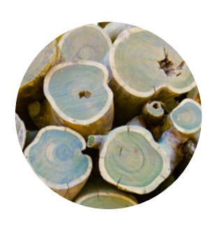
Gaiac Wood Bulnesia sarmientoi