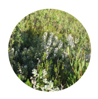
Buchu Barosma betulina

Our product: roots essential oil, seeds essential oil